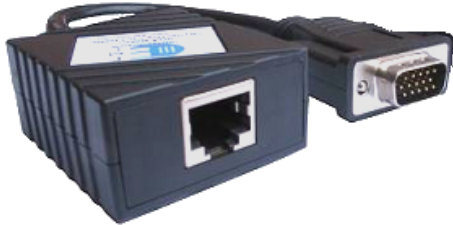
PC Balun Part No: E10680C