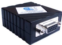
Monitor Balun Part No: E10680M

The VGA Balun has been specifically designed to allow a VGA Monitor to be remotely located from the computer. The VGA Balun comprises a PC Balun and a Monitor Balun. They must be used together as a pair. Shielded Category 5e cable terminated in shielded RJ45 Plug must be used to interconnect the 2 units otherwise there will be picture distortion.