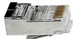
Shielded RJ45 Plug