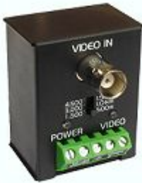
Active Transmitter P/N: E10600T