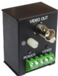
Active Receiver P/N: E10600R