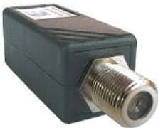
F Female to RJ45 Slim Case P/N E10980FR