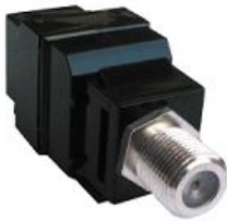
F Female to RJ45 Keystone Case P/N E10980FK