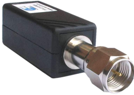
F Male to RJ45 Slim Case P/N E10980MR