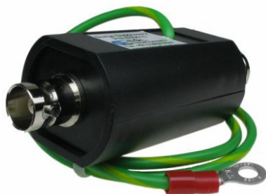
Part Number: E10510F